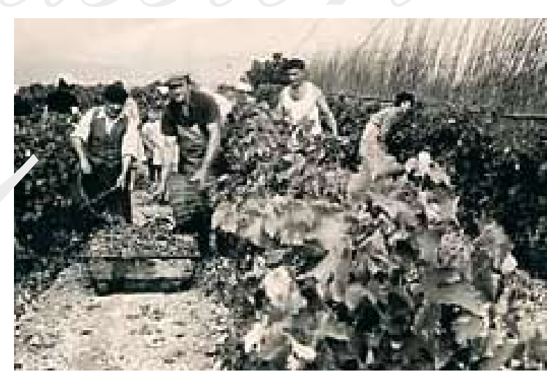
Scène de vendange dans les années 60

This is why our wines are characterised by deep colours from which emanate strong aromatic fragrances that we find in the mouth in a context which is full and generous, and forever harmonious. As a result, the love which we bring to these wines during their maturing (oak or new barrels) is always dictated by a respect for their balance, so as to avoid masking their distinctiveness.